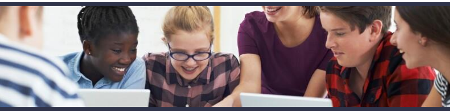
Pallara State School Notebook Order Portal - Senior Years Order Online at <a href="https://pallarasenior.orderportal.com.au">https://pallarasenior.orderportal.com.au</a>